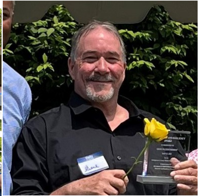
CSP Conference over the years...